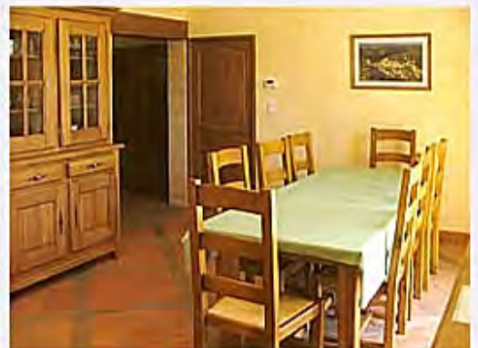
The dining area