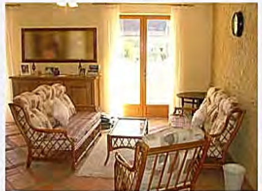
The sitting area