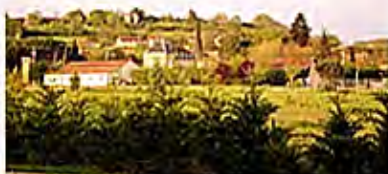
From the kitchen window