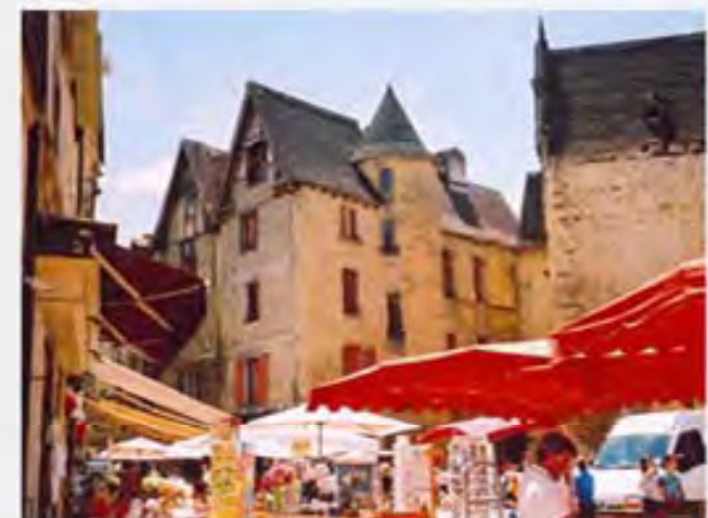
Our favourite market