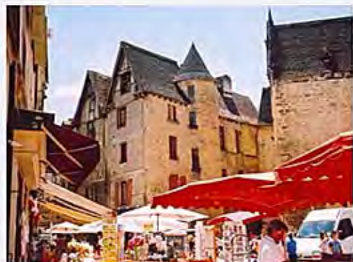
Our favourite market