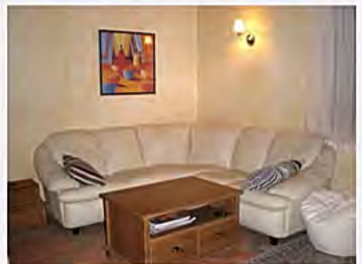
The TV lounge